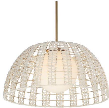
Shown in gold / white / satin white

Varied cotton ropes in an Off-White finish are hand woven in a decorative pattern along a metal frame finished in Gold in the Macrame Pendant. Housed within the artisanal shade, a Satin White glass globe softly diffuses an enclosed lamp. Dimmable via Triac or electronic low voltage (ELV) dimming.