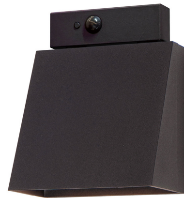
Shown in architectural bronze

LAMP LIFE . . . . . 25000 hours COLOR RENDERING . . . . . 90 CRI LAMP COLOR . . . . . 3000K LUMENS/WATT . . . . . 50.00 LUMINOUS FLUX . . . . . 750 lumens