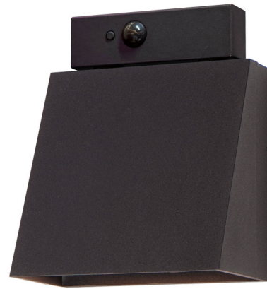
Shown in architectural bronze