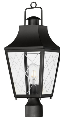
Shown in black / clear

The charming cottage style lantern in the Storybook Outdoor Post Light features a unique cross-etched glass panel that is Clear and beveled along their edges. Additional design details such as whimsical loops above a chimney element add to the product's delightful appearance. Finished in a Matte Black outdoor rated powder coat, the post light recaptures the appeal of storybook lanterns. Dimmable via Triac or electronic low voltage (ELV) dimming. Note: Post sold separately.