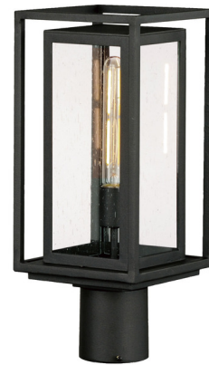
Shown in black / seedy glass

A dual framed structure creates dimension on the Cabana VX Outdoor Post Light that is both contemporary and transitional. The construction consists of two frames of square tubing and squared components. The inner frame's Clear Seedy glass reduces glare from the light and appears dirt-free for longer periods. This is a comprehensive fixture to brighten all areas of your outdoor space designed for harsh climates. Dimmable via Triac or electronic low voltage (ELV) dimming. Note: Post is required and sold separately.