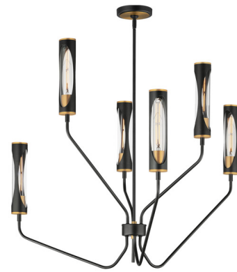
Shown in aged brass / black / clear

PRODUCT DIMENSIONS . . . . . Downrods Included: 1+6", 3+12" LAMP LIFE . . . . . 25000 hours COLOR RENDERING . . . . . 90 CRI LAMP COLOR . . . . . 2700K LUMENS/WATT . . . . . 530.00 LUMINOUS FLUX . . . . . 3180 lumens