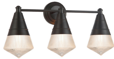
Shown in black / prairie rib frost

PRODUCT DIMENSIONS . . . . . Backplate: 5" Dia.