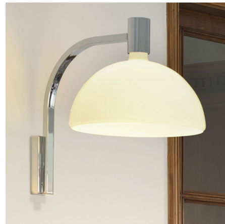
Shown in chrome / opal

The AS3C Wall Sconce, designed by M. Albini, F. Helg, F. Albini, and A. Piva, features an Opal glass diffuser with a widespread beam of light supported by a curved arm. Originally designed in 1969, AS3C encapsulates the essence of Milanese architect Franco Albini's iconic style. Includes 6.7 inch square mounting plate in black finish (not pictured).