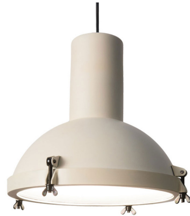
Shown in white sand

The Projecteur IP54 Outdoor Pendant was originally designed by Le Corbusier for the Chandigarh High Court building in 1954. The aluminum body is paired with a rounded, sandblasted glass diffuser that is fastened to the body with locking clips. Projecteur will add a touch of industrial style to any interior. IP54 rated for outdoor use.