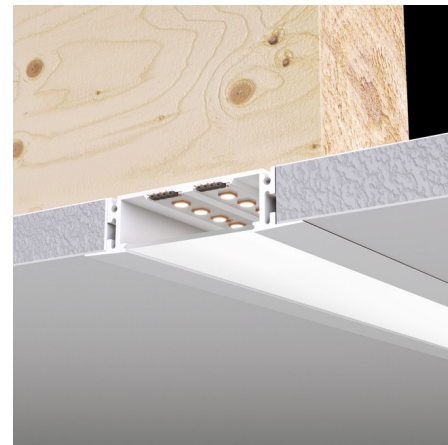
Shown in white

The TruLine Trim 1.6A Static White is a recessed 24VDC LED system that features a paintable half-inch trim. The slim channel extrusions recess within any flat surface, including 5/8 inch drywall, tile, and millwork, eliminating the need for stud or joist modification. The channel, LED strips, and lenses are field-cutttable and ordered in 1' increments (up to 40' before re-feeding), providing flexibility and unparalleled ease of installation. TruLine Trim 1.6A is offered in a range of wattages and color temperatures up to 95+ CRI. 24VDC Remote Power Supplies are required and sold separately. Coordinate installation with electrical and drywall contractors.