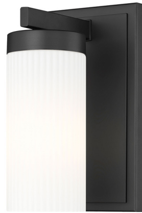
Shown in matte black / white

The Danica Wall Sconce offers a timeless look with its clean lines and simple geometric shapes. The rectangular backplate and minimalist arm support a cylindrical glass shade. A subtle ridged texture in the glass creates added visual interest. Install with glass facing up or down.