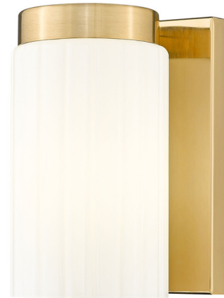
Shown in luxe gold / matte opal

The Burk Wall Sconce is simple but elegant with a ridged cylindrical glass diffuser providing gentle ambient light. The rectangular backplate completes the geometric look for an understated accent. May be mounted with the shade directed up or down.