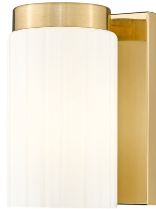
Shown in luxe gold / matte opal

The Burk Wall Sconce is simple but elegant with a ridged cylindrical glass diffuser providing gentle ambient light. The rectangular backplate completes the geometric look for an understated accent. May be mounted with the shade directed up or down.