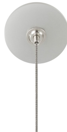
Shown in satin aluminum

The Cirrus Suspension 2 Inch Round Canopy with Junction Box includes a special plaster ring that fits on a 4 inch square or octagon junction box. Optional to the 4 inch square canopy which is included as the standard canopy option on all Cirrus Suspension fixtures. Finish available in Satin Nickel, Chrome, Antique Bronze, Satin Aluminum, White or Satin Black. 2.8 inch diameter.