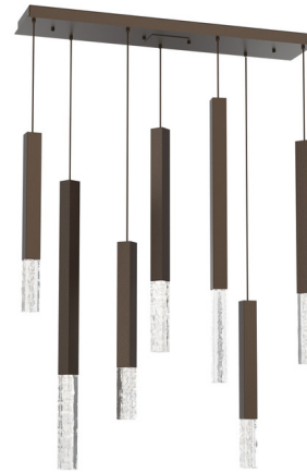
Shown in flat bronze / clear cast

PRODUCT DIMENSIONS . . . . . Min/Max Adjustable Height: 46" - 144" COLOR RENDERING . . . . . 93 CRI LAMP COLOR . . . . . 3000K LUMENS/WATT . . . . . 557.20 LUMINOUS FLUX . . . . . 2942 lumens