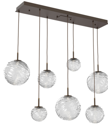
Shown in flat bronze / clear