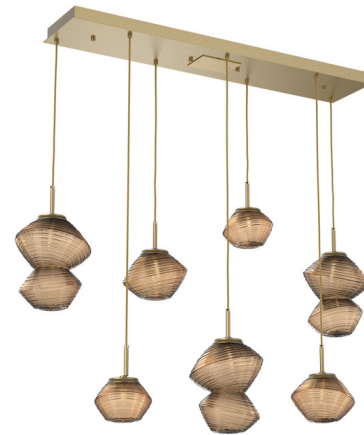
Shown in gilded brass / mesa bronze

The Mesa Linear Multi Light Pendant is inspired by the rugged beauty of Southwestern landscapes. The smooth, lineal frame holds artisan handcrafted molten glass, on each end, that casts warm shadows across your room. Cables are adjustable during installation to create your own unique look. Note: Due to the weight of the 9 light fixture, additional ceiling support is required.