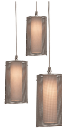
Shown in beige silver / frosted