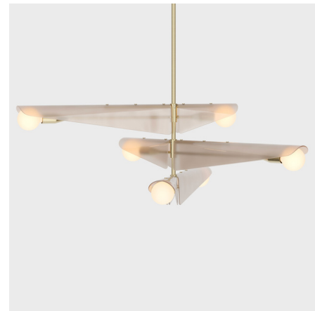
Shown in brushed brass / dusk pink

LAMP LIFE . . . . . 15000 hours COLOR RENDERING . . . . . 95 CRI LAMP COLOR . . . . . LUMENS/WATT . . . . . 514.29 LUMINOUS FLUX . . . . . 3600 lumens