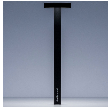
Shown in matte black