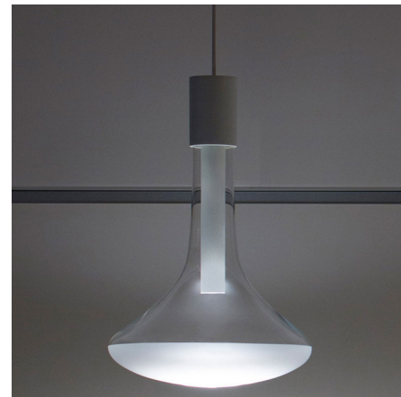
Shown in matte white / clear / frost

COLOR RENDERING . . . . . 90 CRI LAMP COLOR . . . . . 2700K LUMENS/WATT . . . . . 51.07 LUMINOUS FLUX . . . . . 286 lumens