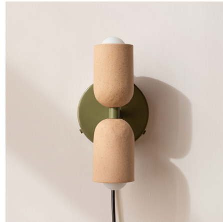
Shown in reed green canopy / tan clay upper shade

The Ceramic Up Down Sconce features upper and lower shades in Tan Clay with a Reed Green canopy. Each ceramic shade is made by hand and left raw or pigmented. They are all one-of-a-kind. In-line on/off switch.