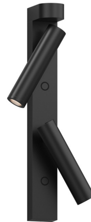
Shown in textured black / textured black

COLOR RENDERING . . . . . 90 CRI LAMP COLOR . . . . . 3000K LUMENS/WATT . . . . . 172.50 LUMINOUS FLUX . . . . . 690 lumens