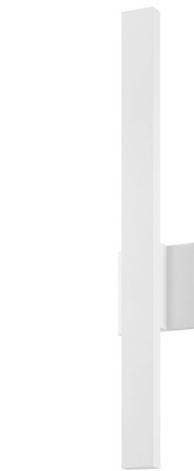
Shown in textured white