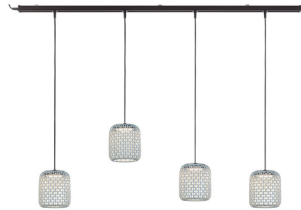
Shown in aluminum / beige

COLOR RENDERING . . . . . 90 CRI LAMP COLOR . . . . . 2400K LUMENS/WATT . . . . . 409.30 LUMINOUS FLUX . . . . . 3520 lumens