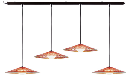
Shown in aluminum / red