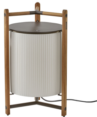
Shown in teak wood / white ribbon

The Kando Floor Lamp takes its name from a Japanese word used to describe the deep emotions experienced while in the presence of something extremely valuable. Both decorative and functional, Kando was designed to transform any space's atmosphere with its warm light. The triangular teak wood frame surrounds a cylindrical fabric ribbon lamp shade, which softly filters light from the integrated LED light source. Includes built-in three-step dimmer (100% / 66% / 33%) and CCT-select (2200K, 2400K, or 2700K) on top of lamp.