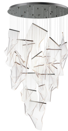
Shown in brushed gunmetal / clear patterned acrylic

COLOR RENDERING . . . . . 90 CRI LAMP COLOR . . . . . 3000K LUMENS/WATT . . . . . 960.00 LUMINOUS FLUX . . . . . 2400 lumens