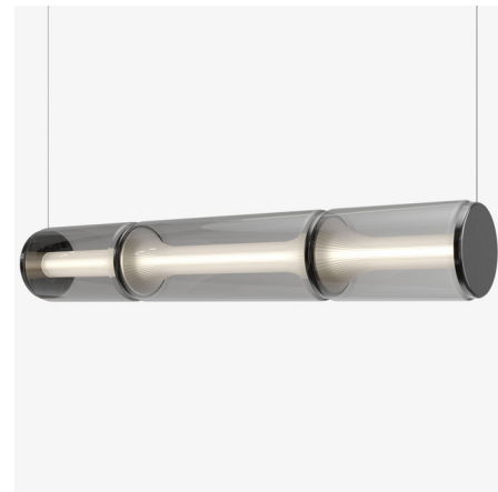
Shown in graphite / graphite

PRODUCT DIMENSIONS . . . . . Cord Length: 59.1" LAMP COLOR . . . . . 2700K