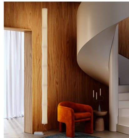
Shown in matte white / white

The Take Plus Bluetooth Floor Lamp is inspired by bamboo shoots and will blend into decor styles from contemporary to transitional. The polyethylene shade is suspended from the ceiling with a support cable, while a power cable from the bottom of the lamp plugs into the wall. Includes pedal dimmer switch, or can be dimmed with Bluetooth control app for Android and iOS Systems.