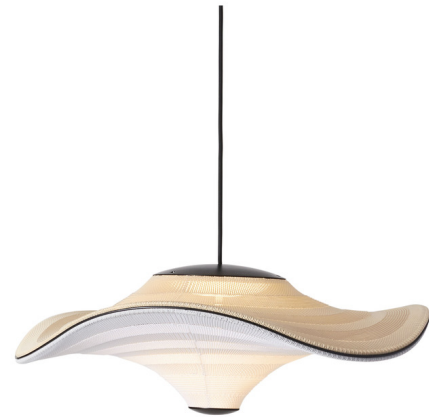
Shown in black / golden sand

PRODUCT DIMENSIONS . . . . . Adjustable Cable Length: 118" COLOR RENDERING . . . . . 90 CRI LAMP COLOR . . . . . 3000K LUMENS/WATT . . . . . 91.00 LUMINOUS FLUX . . . . . 2184 lumens