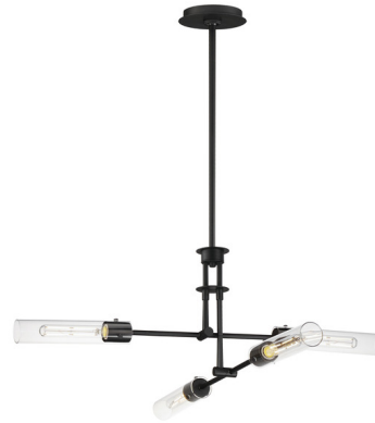
Shown in black / clear

LAMP LIFE . . . . . 25000 hours COLOR RENDERING . . . . . 90 CRI LAMP COLOR . . . . . 2700K LUMENS/WATT . . . . . 320.00 LUMINOUS FLUX . . . . . 1920 lumens