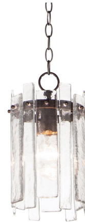
Shown in dark bronze / clear

The Warren Pendant brings an elegant sophistication to your interior space. Organic molten glass panels drape on a smooth, ring frame and casts warm shadows of light across your room.