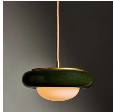
Shown in unlacquered brass / royal green ceramic

The Humboldt 01 Pendant pays homage to early twentieth century California craft with its combination of natural materials, smooth geometric forms, and rich colors. A stoneware ceramic ring surrounds an opal glass dome with an integrated LED providing warm, diffused illumination. Dimmable with ELV, TRIAC, or 0-10V dimmers at 120V; 0-10V dimming only at 277V. Available with Unlacquered Brass or Matte Ivory canopy.