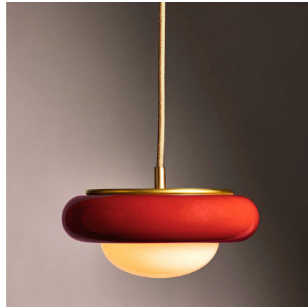
Shown in unlacquered brass / cayenne ceramic

The Humboldt 01 Pendant pays homage to early twentieth century California craft with its combination of natural materials, smooth geometric forms, and rich colors. A stoneware ceramic ring surrounds an opal glass dome with an integrated LED providing warm, diffused illumination. Dimmable with ELV, TRIAC, or 0-10V dimmers at 120V; 0-10V dimming only at 277V. Available with Unlacquered Brass or Matte Ivory canopy.