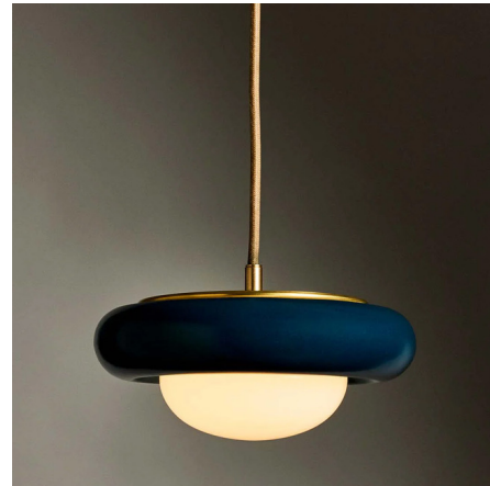
Shown in unlacquered brass / harbor blue ceramic

The Humboldt 01 Pendant pays homage to early twentieth century California craft with its combination of natural materials, smooth geometric forms, and rich colors. A stoneware ceramic ring surrounds an opal glass dome with an integrated LED providing warm, diffused illumination. Dimmable with ELV, TRIAC, or 0-10V dimmers at 120V; 0-10V dimming only at 277V. Available with Unlacquered Brass or Matte Ivory canopy.