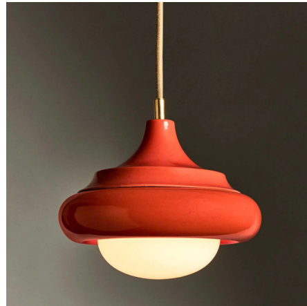
Shown in unlacquered brass / cayenne ceramic

The Humboldt 02 Pendant pays homage to early twentieth century California craft with its combination of natural materials, smooth geometric forms, and rich colors. A stoneware ceramic ring with an ornately tiered cap surrounds an opal glass dome with an integrated LED providing warm, diffused illumination. Dimmable with ELV, TRIAC, or 0-10V dimmers at 120V; 0-10V dimming only at 277V. Available with Unlacquered Brass or Matte Ivory canopy.