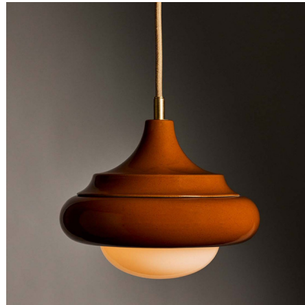
Shown in unlacquered brass / cinnamon ceramic

The Humboldt 02 Pendant pays homage to early twentieth century California craft with its combination of natural materials, smooth geometric forms, and rich colors. A stoneware ceramic ring with an ornately tiered cap surrounds an opal glass dome with an integrated LED providing warm, diffused illumination. Dimmable with ELV, TRIAC, or 0-10V dimmers at 120V; 0-10V dimming only at 277V. Available with Unlacquered Brass or Matte Ivory canopy.