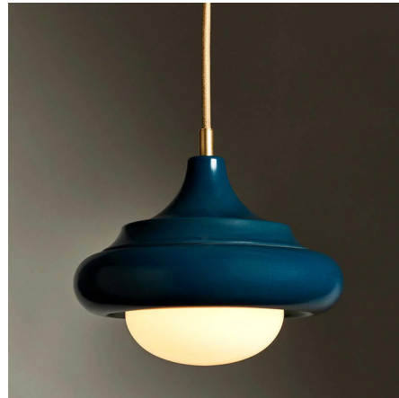
Shown in unlacquered brass / harbor blue ceramic

The Humboldt 02 Pendant pays homage to early twentieth century California craft with its combination of natural materials, smooth geometric forms, and rich colors. A stoneware ceramic ring with an ornately tiered cap surrounds an opal glass dome with an integrated LED providing warm, diffused illumination. Dimmable with ELV, TRIAC, or 0-10V dimmers at 120V; 0-10V dimming only at 277V. Available with Unlacquered Brass or Matte Ivory canopy.