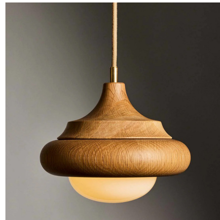
Shown in white oak / opal

The Humboldt 02 Wooden Pendant pays homage to early twentieth century California craft with its combination of natural materials and smooth geometric forms. A wooden ring with an ornately tiered cap surrounds an opal glass dome with an integrated LED providing warm, diffused illumination. Dimmable with ELV, TRIAC, or 0-10V dimmers at 120V; 0-10V dimming only at 277V. Available with Brass canopy or canopy in matching wood finish.