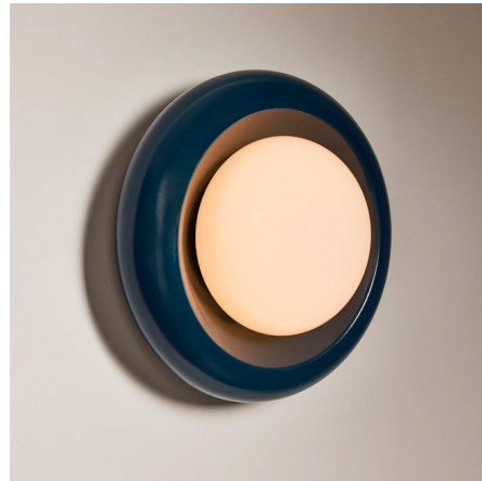
Shown in harbor blue ceramic / opal

The Humboldt Wall Sconce pays homage to early twentieth century California craft with its combination of natural materials, smooth geometric forms, and rich colors. A stoneware ceramic ring surrounds an opal glass dome with an integrated LED providing warm, diffused illumination. Dimmable with ELV, TRIAC, or 0-10V dimmers at 120V; 0-10V dimming only at 277V.