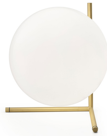
Shown in brass / opal

COLOR . . . . . Opal BODY FINISH . . . . . Brass WATTAGE . . . . . 14W DIMMER . . . . . Included DIMENSIONS . . . . . 18.9"W x 20.63"H x 17.7"D BULB NOT INCLUDED . . . . . 1 x A19/Medium (E26)/14W/120V LED OTHER BULB OPTIONS . . . . . 1 x A19/Medium (E26)/100W/120V Incandescent