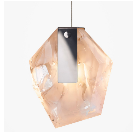
Shown in anthracite / white fragmentglass

COLOR RENDERING . . . . . 90 CRI LAMP COLOR . . . . . 2700K LUMENS/WATT . . . . . 91.67 LUMINOUS FLUX . . . . . 110 lumens