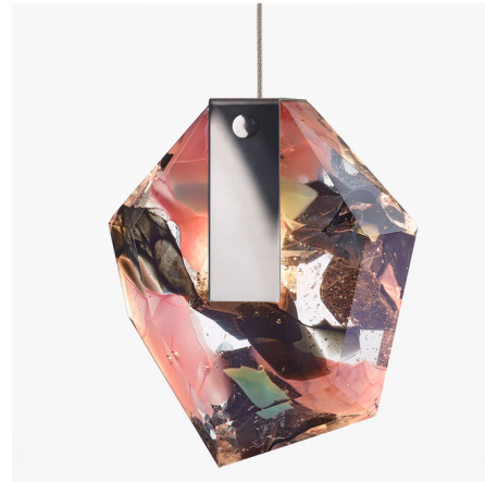
Shown in anthracite / flamingo mint fragmentglass

COLOR RENDERING . . . . . 90 CRI LAMP COLOR . . . . . 2700K LUMENS/WATT . . . . . 91.67 LUMINOUS FLUX . . . . . 110 lumens