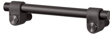
Shown in gun metal

The Cast Pull Bar is made from solid Metal and features a rough-cast knuckle and hand-polished design. Gun Metal: Made from Stainless Steel and then finished with Gun Metal PVD. Will stay the same for years to come. Easy to clean. NOTE: This is a discontinued model and limited to quantity on hand.