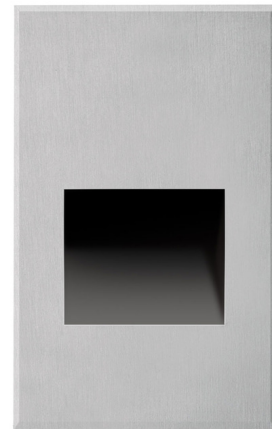
Shown in brushed nickel

FUNCTION . . . . . Shower/Wet Location LAMP LIFE . . . . . 50000 hours COLOR RENDERING . . . . . 90 CRI LAMP COLOR . . . . . 3000K LUMENS/WATT . . . . . 16.50 LUMINOUS FLUX . . . . . 66 lumens