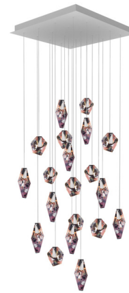
Shown in anthracite / flamingo mint fragmentglass

COLOR RENDERING . . . . . 90 CRI LAMP COLOR . . . . . 2700K LUMENS/WATT . . . . . 1,666.67 LUMINOUS FLUX . . . . . 2000 lumens