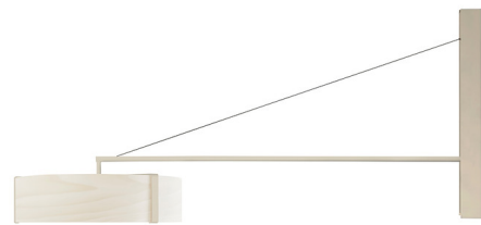
Shown in matte ivory / ivory white

The Thesis Wall Sconce is authoritative and introspective, a quiet light with a smart, introverted personality. This modern piece, whose companionship is close and intimate, casts a warm glow as you toil through the night, or by your side as you read or simply contemplate the day. Includes round cover plate (not pictured) for standard 4in US junction box.