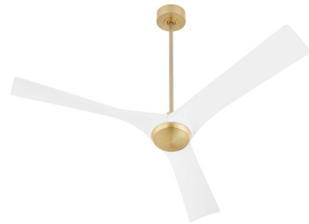
Shown in aged brass / white