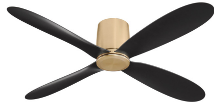
Shown in aged brass / aged brass

The Myriad Hugger Ceiling Fan brings a clean look to your interior space. The 4 rounded ABS blades provide a powerful cooling in your small rooms. Equipped with Smart by Bond technology, allowing you to control the settings from any smart device. Includes a wall control. Optional light kit is sold separately below. 6 speeds, reversible, has a DC-15NS motor, 56 inch blade sweep, and 13 degree blade pitch. Measured at high it has airflow: 5832, Electric Energy Consumption: 30W, and airflow efficiency: 167 CFM/W.