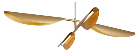
Shown in aged brass