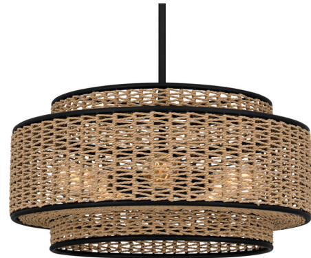
Shown in matte black / natural rope

The Teton Pendant spotlights global styling and natural elements. The classic drum silhouette is accentuated by a matte black finish and casual layers. A natural rope shade adds depth and contrast to the otherwise simple frame, providing a hint of coastal design. Note: Not all options available.